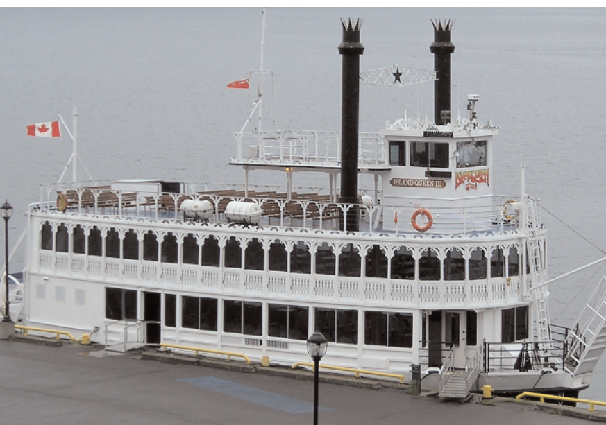
KM set sail when this St. Lawrence riverboat hosted some of the world's leading KM thinkers on a Thousand Islands cruise